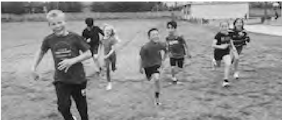
Seacliff students prepare for running the final mile with a before-school practice session.

Thirteen percent of the students at Seacliff participated in Kids Run the OC. As is evidenced in our participation numbers, there was great enthusiasm for this program amongst our students.