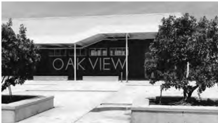
The new gym will feature an indoor sports court, stage, outside courtyard, and shade structure.

Oak View Elementary is getting a new gymnasium! We are so excited to see the progress every day as the construction crews put the finishing touches on the outside of the gym and complete the interior. Complete with a courtyard of beautiful trees, concrete planters for additional seating and an outdoor shade structure for lunch, the new gym will provide a true center for the Oak View community to use during the day and night for school and community activities. The interior has a full-size basketball court, bleachers and a performance stage. We recently purchased new sports equipment for the gym, including volleyballs, basketballs, and even yoga mats! We cannot wait to see it completed this summer.