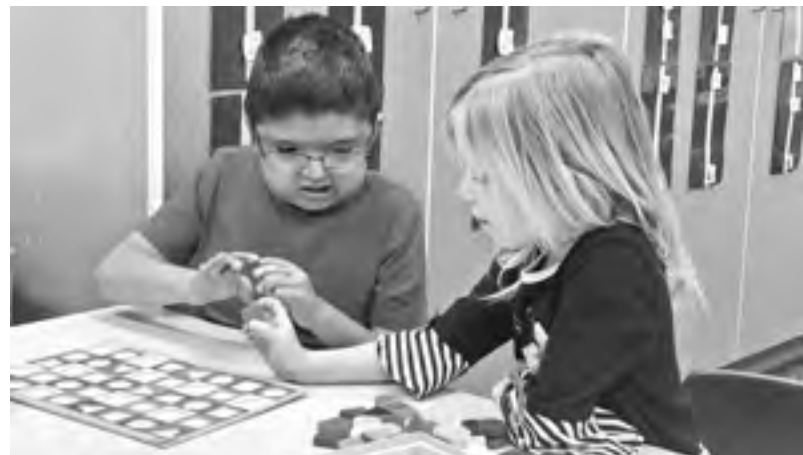
Students celebrate kindness and have fun doing it!

Volunteers helped students with special needs to read books, complete assignments, and play educational games. The month of kindness also included a video created by our fifth-grade Girl Scout Troop, the planting of pinwheels for Orange County’s The Raise Foundation, pay-it-forward kindness acts, and painting rocks to install in the front of our school as a lasting reminder that kindness is important at Lake View.