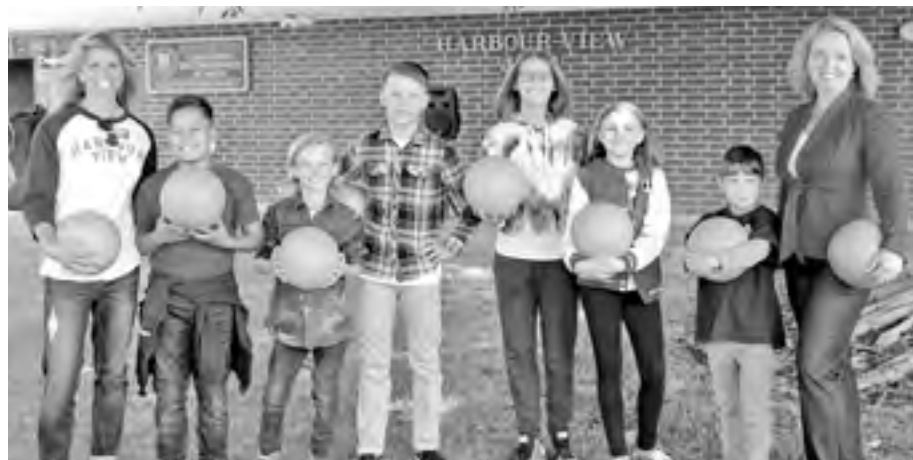
Harbour View Elementary School partners with One World Play Project to connect South African and local students.

With news crews and reporters from CNN International and the Los Angeles Times, this social-impact organization visited our site for an assembly to celebrate our partnership with children in South Africa to learn about how kids play, interact, and compete in different places. Our purposeful mission to teach students that relationships matter is the cornerstone to our growing character-education program, and this experience is a strong demonstration to this commitment.