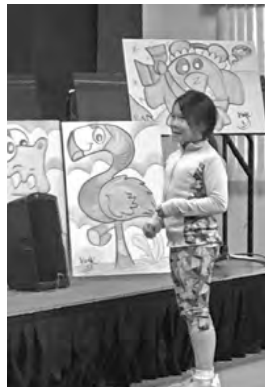
Students enjoyed making unique artwork during recent VAPA assemblies.

During the day, Star View Elementary School students participated in highly interactive, fun-filled art assemblies packed with Visual and Performing Arts standards, as well as cross-curricular benefits for students' math skills. Each child created pieces of artwork, which they then took home to share with family members. Students also had the opportunity to return to school in the evening with family members for a "Draw-Along Art Evening." All participants engaged in the art assembly, guided by presenter Kyle Tiernan. In the end, everyone walked away with three unique pictures. A few students were thrilled they won artwork created by the presenter. Parents, teachers and children all loved the experience.