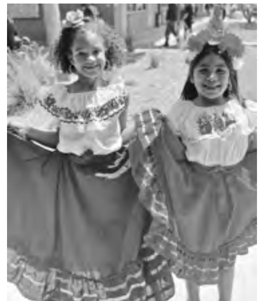
1st Grade Dual Immersion students performing for our celebration

We are so proud to give them the opportunity to learn Spanish, English, and coding in our successful Dual Language Immersion Academies in the Westminster School District.