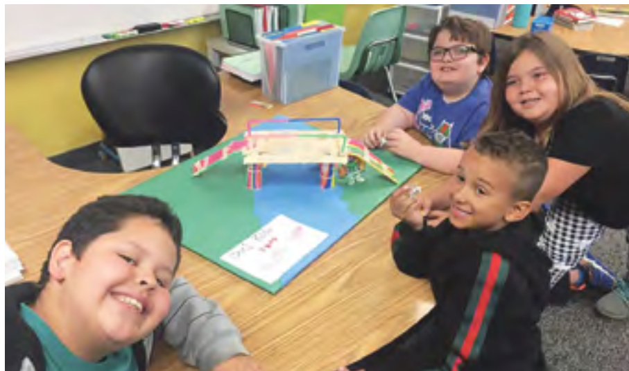
Village View Elementary students proudly demonstrating their learning, which involved designing solutions and creating DOK projects.

Although each of the seven tenets is an important piece of today's Ocean View, the first tenet's focus on student achievement and development is critical to our daily purpose and practices. On a regular basis, our students and teachers are asking deeper questions about a variety of subjects as part of the learning process. Students are being encouraged to make choices in their own learning to boost confidence and engagement, while teachers are guiding them to make connections between the classroom and real life.