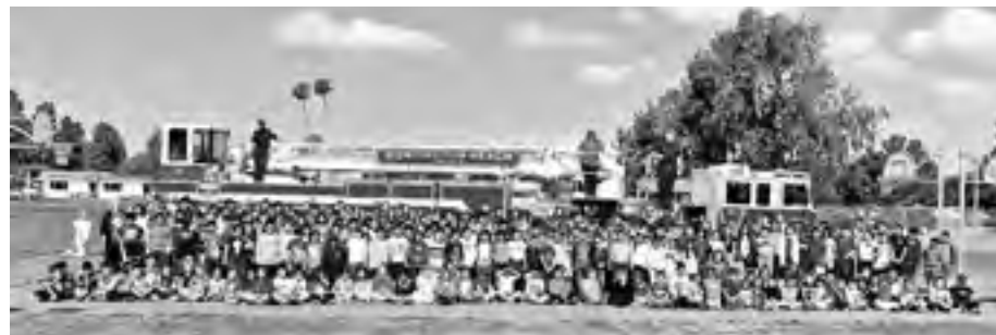
Students enjoy the annual ball drop event.

We wish our colleagues at College View Elementary School a wonderful year during modernization in 2019-2020. We're excited to be going home.