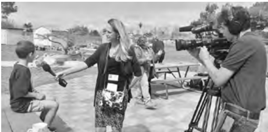
First grader talks about learning about recycling with "Orange Slices" producer.

Zero Waste efforts. Golden View is proud to offer rigorous academic instruction while integrating Environmental Science literacy. Go check out the link below to see the "Orange Slices" episode on YouTube, http://bit.ly/goldenviewstory .