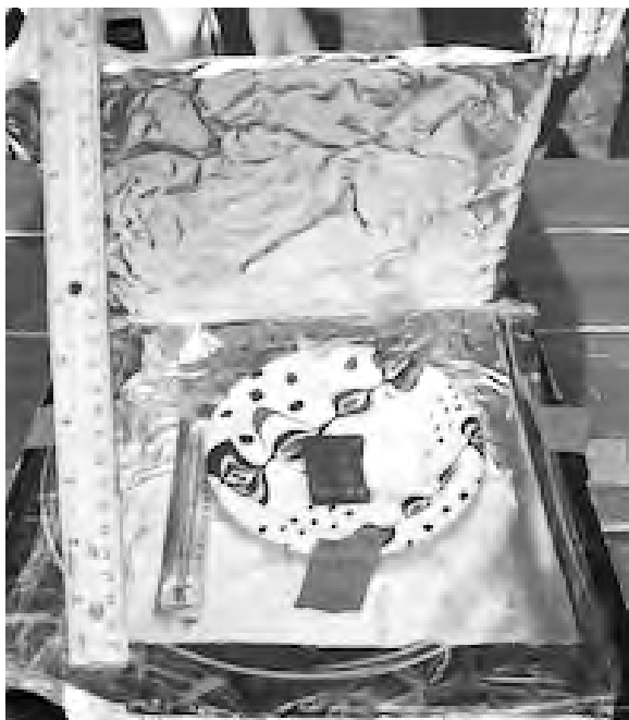
Students demonstrate using solar oven energy to make s'mores.

After testing their ovens, students compared the data to determine which ovens worked best, and why. They looked at their own data as well as the data from other teams to decide how they would change their design to maximize the sun's rays. After analyzing the data, teams must now design and develop a product that they will "take to market," using the lessons they learned from the previous designs. Teams are preparing to present their data and new products to their peers.