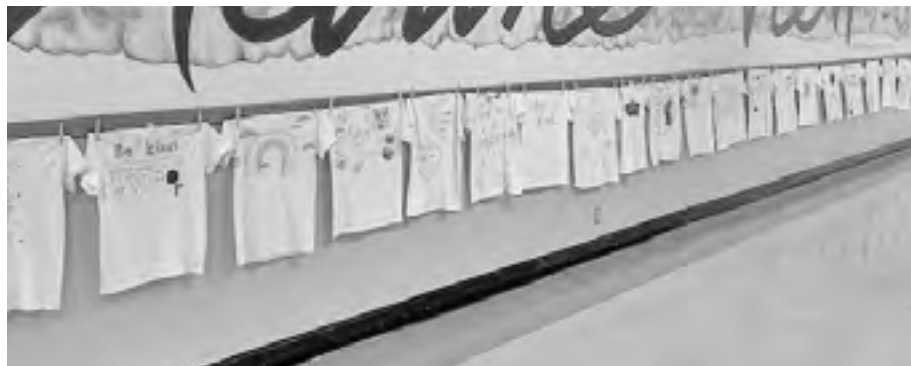
Marine View halls are lined with Kindness Week shirts created by students.

Our students also reflected on the ways in which they have shown kindness to others, and made “kindness commitments” for the future. We also demonstrated how to show kindness and respect on social media, and challenged everyone to go “social media-free” for 24 hours. Mariners who were “caught” being kind during the week were given Kindness Tickets for a raffle.