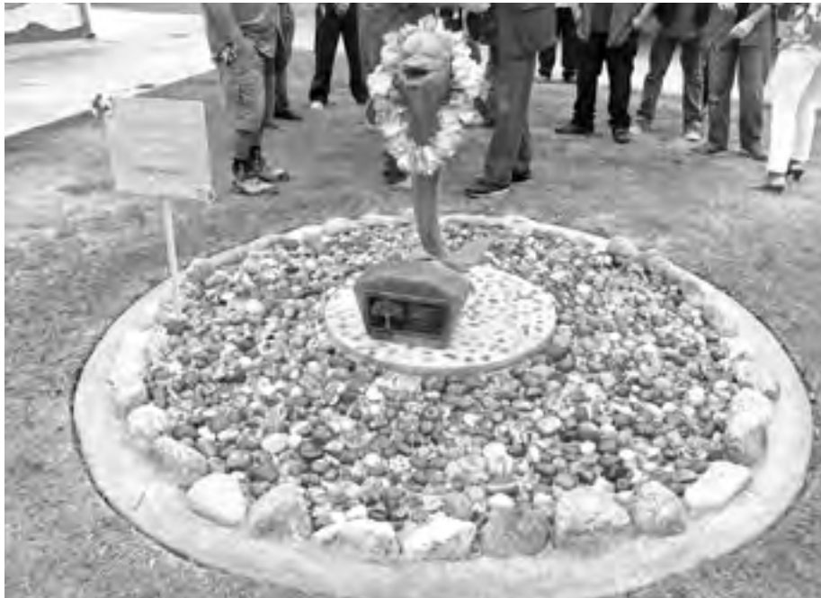
Village View's new artwork surrounds its central dolphin sculpture and memorial.

At the assembly, our staff and students also revealed a new art project. Over several weeks, each Village View student painted an individual rock in bright colors around the theme of Only One You , a book by author Linda Kranz. The rock art will now permanently surround our school's central dolphin statue.