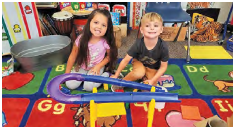
Ocean View Preparatory Preschool students build & explore with materials & shapes. (please see page 11)

We are excited about the good work we are doing on behalf of our Ocean View families and look forward to our ongoing efforts to bring The OVSD Blue Print to life!