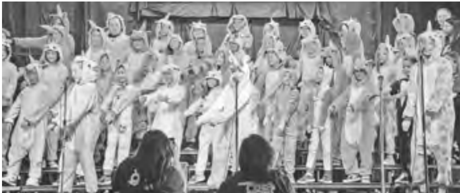
Eader Glee Perform Sunshine, Rainbow and a Unicorn in Chinese